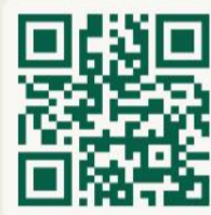
Full Bio & Portfolio